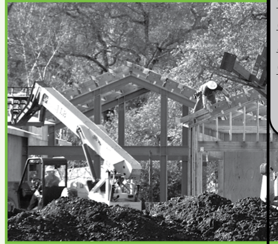
Construction continues on Hanna's new facilities, including the 7,800-square-foot Admissions and Alumni Center and 8,950-square-foot Multi-Use Auditorium.